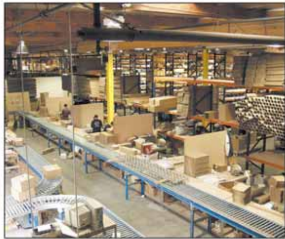
Largest Inventory Anywhere

The first home of the Original Parts Group was located in Anaheim, California and was approximately 1200 square feet. That was over 19 years ago and since then we have moved six times, always going to larger and larger facilities to expand our product line and improve our customer service. Our newest facility is located on over 2 acres (90,000 square feet), making it the largest operation in the United States devoted exclusively to GM A-body parts and accessories. There is over 50,000 square feet under roof, with a further 4,000 square feet under construction. We are located on Bolsa Ave., a main thoroughfare in Huntington Beach, California, directly across the street from the southern California headquarters facility of the Boeing Corporation. With the operational capabilities we have in this enormous new building, we are able to pull, pack, and fill orders for shipping with unparalleled accuracy and speed. We would like to thank you, our loyal customers, for this explosive growth and support through the years. Be assured that we will continue to uphold Original Parts Group's company mission: To offer the finest reproduction and aftermarket parts and accessories for GM A-bodies at the very best prices anywhere. So, we would like to say.... Thank you very much for shopping at Original Parts Group.